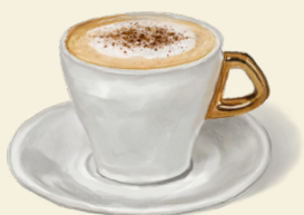
Cappuccino |G 7.1 espresso · foamed milk