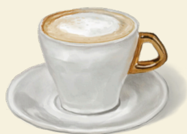
Viennese “Melange” |G 6.9 long espresso shot · foamed milk