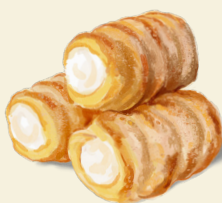
Mini Puffed Pastry Rolls A|C|G 9,- 3 puffed pastry rolls · meringue filling