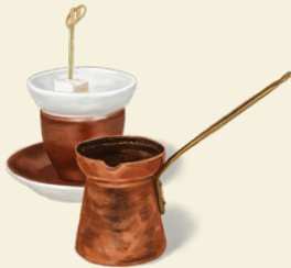
Turkish Coffee |H 8.2 boiled coffee · sweetened or unsweetened · Lokum