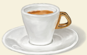
Americano 7.5 espresso shot · black or with milk