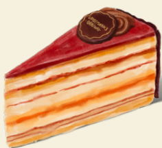
Landtmann's Feine Torte A|C|F|G|H|J|O 8.5 marzipan · hazelnut nougat buttercream · hazelnut sponge cake